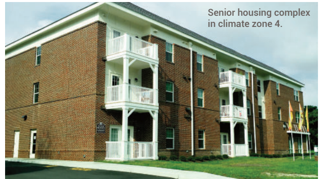
Senior housing complex in climate zone 4.

Following a typical humid summer, one of the residents of a one-bedroom, first-floor, 585-square foot apartment began noticing microbial growth on her clothes in the bedroom closet, on her bookcase, and on the walls in the living room. In late August, the