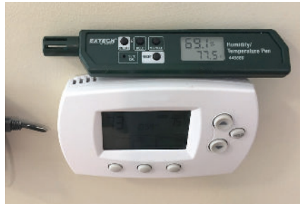
Conditions inside apartment were 69% RH and 78°F.