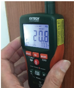
Wood moisture content of bookcase measured at a moist 20.8.

There was intense pressure to find a solution to the moisture problem that didn't involve making the apartment resident uncomfortably cold.